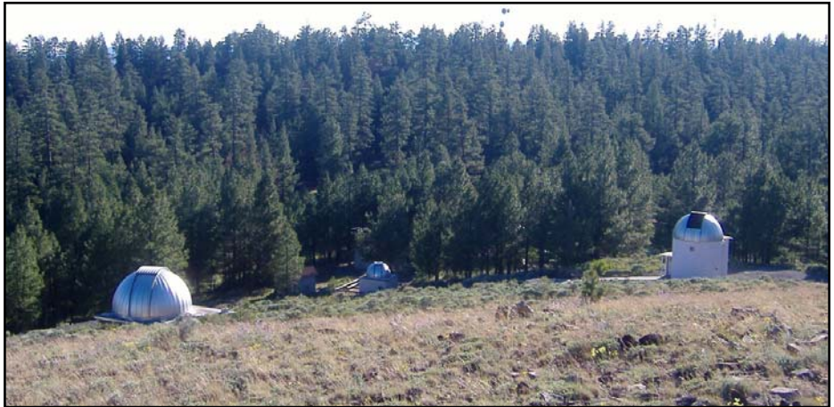
Pine Mountain Observatory's telescope facilities. The dome on the left houses a 32 inch telescope, the middle dome contains a 15 inch telescope, and the right dome has a 24 inch Boller and Chivens telescope.